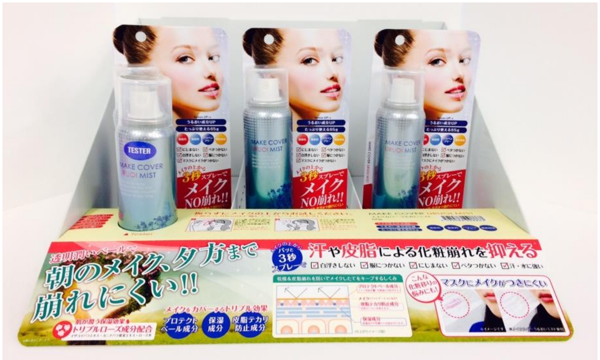
W320mm × H300mm × D240mm