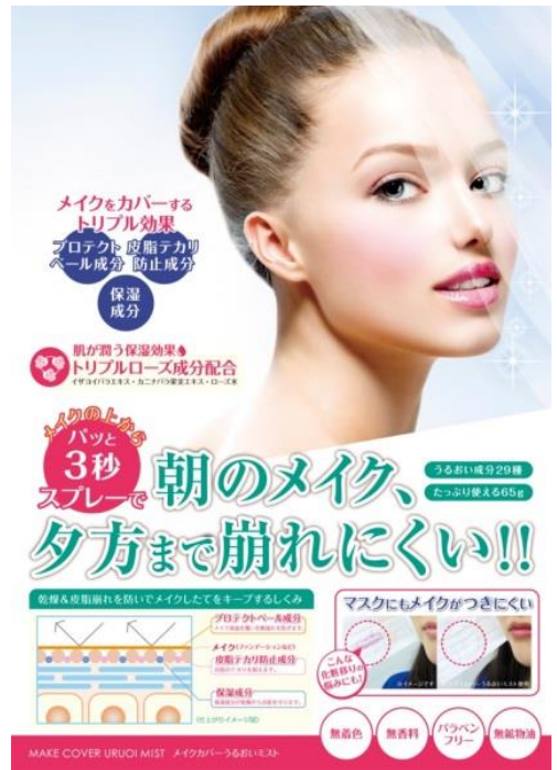
W90mm × H55mm × D225mm