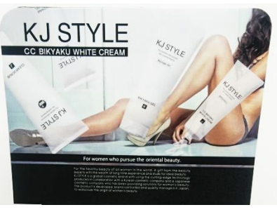
Back board comes with 2 patterns.