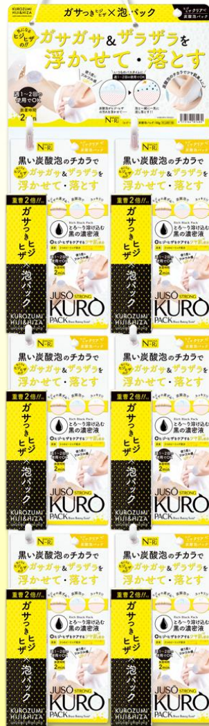
Size (includes products) W190 x H650 mm