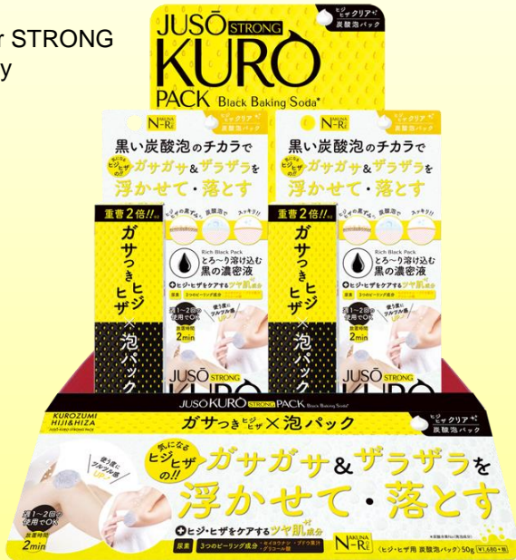
W190 x H245 x D280 mm