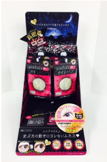
W180mm x H330(220)mm x D220mm *The top panel can be removed.