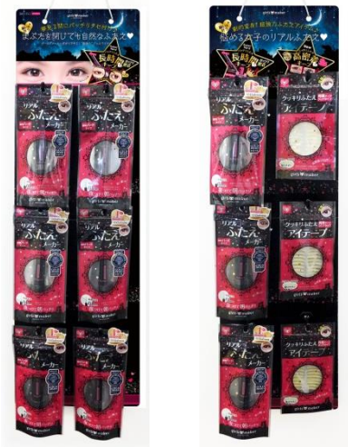
W190mm x H650mm x D2mm

For "Eternity Line Alfa" x 12 pcs, "Eternity Eye Tape" x 6-12 pcs