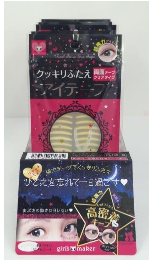
W84mm x H40mm x D154mm