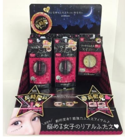
W270mm x H330(220)mm x D220mm *The top panel can be removed.

Fits with both products of "Eternity Line Alfa" x 12 pcs, "Eternity Eye Tape" x 6 pcs, or "Eternity Line Alfa" x 18 pcs